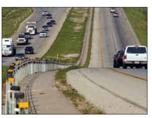
This CMB installed along IH 20 in Texas had an immediate impact in reducing the number of fatalities from cross median collisions.

Best Practice Information: An initial team goal was to accumulate "best practice" guidelines from the several states already using CMB, from CMB producers, and from researchers. The most helpful and detailed information was provided by lead states team members themselves, based on their own state experiences.